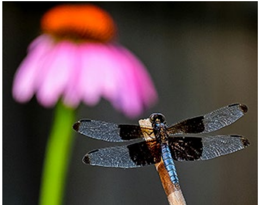
Widow Skimmer Dragonfly

After the class, we will have a short field trip to look for dragonflies and damselflies at the nature center. A limited number of binoculars will be available if you do not have a pair of binoculars.