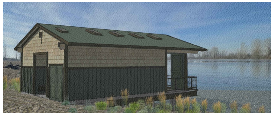
Architect rendering of the new classroom.